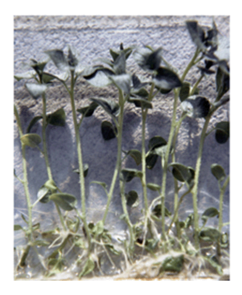
Figure 3b. Cassette style of potato culture at 4 weeks.