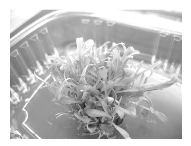
Figure 2. Subculture of Figure 1 explant into 50 plantlets for rooting.